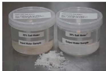
Test in Australia successfully 在澳洲样品测试成功