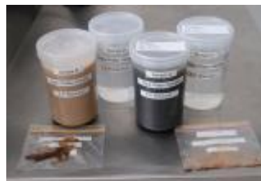
Test in Australia successfully 在澳洲样品测试成功